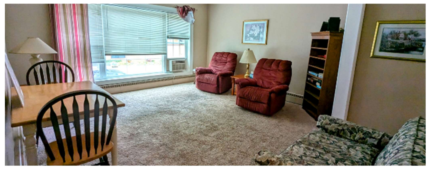
The living room from one of our apartments in Anchor Home

We understand that the community that supports us also trusts us to continue our practice of solid fiscal management. Our fiscal policies ensure that we can meet our obligations of today, provide for unplanned capital expenses, and fund new opportunities for the future. We expect no less of ourselves than we do of our participants. Key expense notes are as follows: